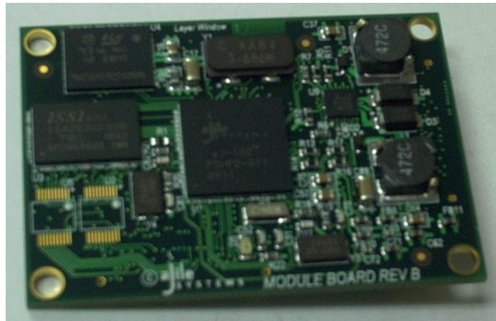
Figure 1. Block Diagram of aJ-102

It provides customers a complete MCU for evaluation of the aJ-102 processor technology. This allows customers to rapidly implement a prototype, and develop the application software. It also can be used in the final product. The simplified block diagram of jMCU-102 is illustrated in the figure 1